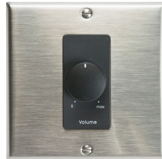
Decora Style Two-Gang Plate Stainless Steel & Black