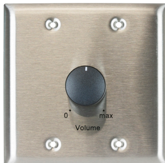
Standard Two-Gang Plate Stainless Steel

The volume control shall be Lowell Model _____ with 200W power rating, 3dB per step attenuation and two 6dB positions before "Off." The control shall have plug-in termination for up to 14-gauge wire for 70V or 100V input connections from the amplifier and 70V or 100V output to the speaker/transformer assemblies. The plate shall be two-gang _____ (standard, Decora®) style with _____ (stainless steel, stainless steel & black) finish. It shall feature a black rotary knob. The volume control shall mount in a standard two-gang E.O. box with minimum depth of 2.5" including mud ring, if used. The box is not included.