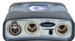
RS-703 Bottom View