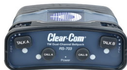
RS-703 Top View