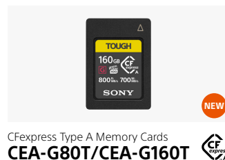
CFexpress Type A Memory Cards CEA-G80T/CEA-G160T