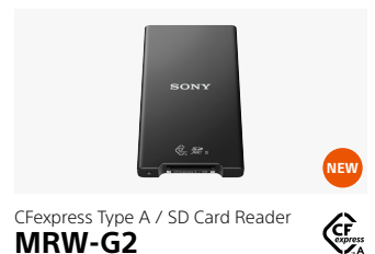
CFexpress Type A / SD Card Reader MRW-G2