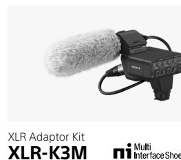
XLR Adaptor Kit XLR-K3M Multi Interface Shoe