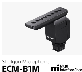
Shotgun Microphone ECM-B1M Multi Interface Shoe