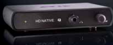
Pro Tools|HD Native Thunderbolt interface