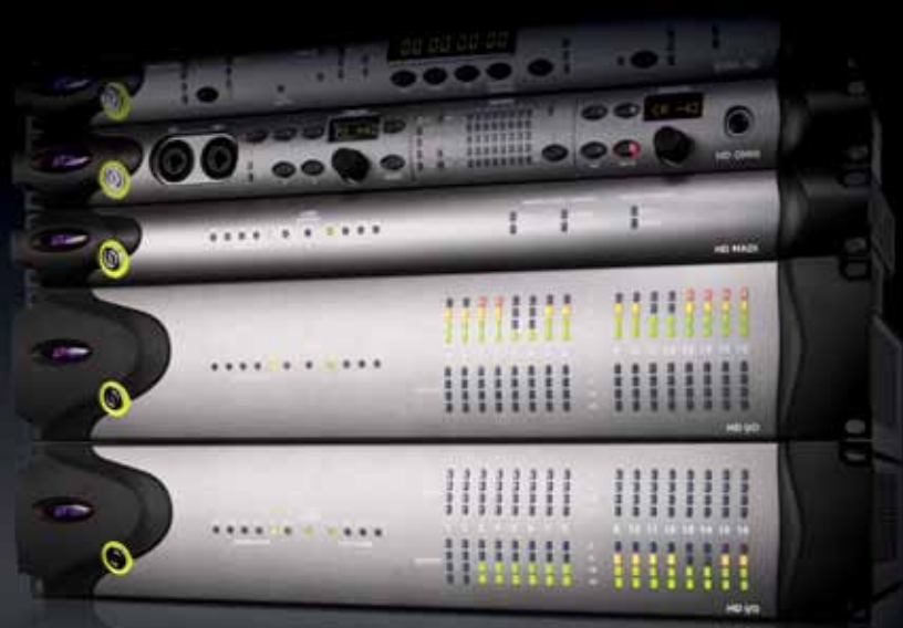
Pro Tools|HD Series interfaces