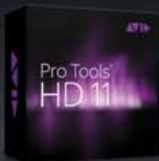
Pro Tools HD 11 software

Avid® Pro Tools®|HD has revolutionized how professionals record and mix music and sound for picture since its debut 10 years ago. And that precedence continues with the new generation systems—Pro Tools|HDX and Pro Tools|HD Native, featuring Pro Tools HD 11. Get the sound and performance you need to take on the most demanding projects.