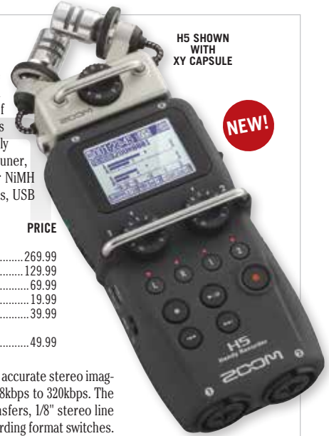
H5 SHOWN WITH XY CAPSULE

ZOOM H5 PORTABLE HANDHELD RECORDER The H5 is a 4-channel portable recorder that features the same interchangeable microphone capsule system as Zoom's flagship H6 recorder. The H5 features a max SPL of 140dB and shock-mounted microphones to reduce handling noise. Two XLR/TRS combo jack inputs allow for up to four channels of simultaneous recording directly to SD and SDHC cards up to 32GB, and can also be used as a USB audio interface. It is capable of recording up to 24-bit/96kHz audio in BWF or MP3 formats up to 320 kbps. The large backlit display and easily accessible controls mean less time changing settings and more time recording. Also features built-in effects, chromatic tuner, metronome, A/B loop playback, auto-record, pre-record and backup-record functions and uses standard AA alkaline or NiMH rechargeable batteries (over 15 hours of operation with alkaline). Includes XY capsule, 2GB SD card, (2) AA batteries, USB cable, foam windscreens, storage case, Steinberg WaveLab LE software and Steinberg Cubase LE software.