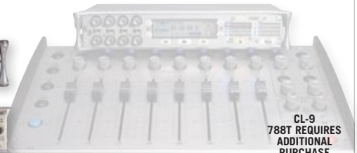
CL-9 788T REQUIRES ADDITIONAL PURCHASE