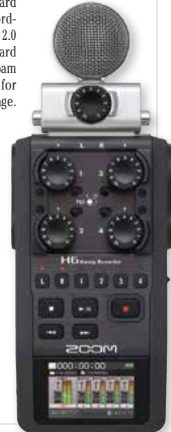
H6 SHOWN WITH MID-SIDE CAPSULE

ZOOM H6 HANDY RECORDER The H6 handheld recorder features an interchangeable microphone capsule system and four XLR/TRS inputs, allowing for up to 6 channels of simultaneous recording. The unit can also function as a 6x2 USB audio interface. Runs for >20 hours on (4) AA batteries and supports SDXC memory cards up to 128GB. The H6 ships with XY and Mid-Side capsules, a foam windscreens, USB cable, 2GB SD card, Cubase LE software, four AA batteries and plastic carrying case. The optional APH-6 Accessory Pack includes a professional furry windscreens, wired remote control, AC power adapter and USB charging cable. Optional shotgun microphone and external XLR/TRS input modules are also available.