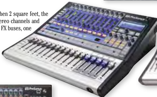
REMOTE iPad® CONTROL