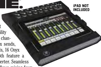
iPAD NOT INCLUDED

Full-featured digital mixers that combine with the ease and mobility of an iPad®. The DL808 has 8 channels, 8 Onyx mic pres and 4 aux sends, while the DL1608 has 16 channels, 16 Onyx mic pres and 6 aux sends. Both feature a 24-bit Cirrus Logic® AD/DA converter. Seamless wired or wireless iPad control allows mixing from anywhere in the venue and they support up to 10 iPads. This gives mobile freedom to control not only the mix, but also powerful plug-ins like EQ, dynamics, effects and more. Plug-ins on each channel include 4-band EQ, compression, gate, reverb and tap delay. The main and aux outs include 31-band EQ, graphic EQ and compressor/limiter. Other features include snapshot recall, 6 aux sends, recording/mixing to iPad, and more. WiFi is required for remote use.