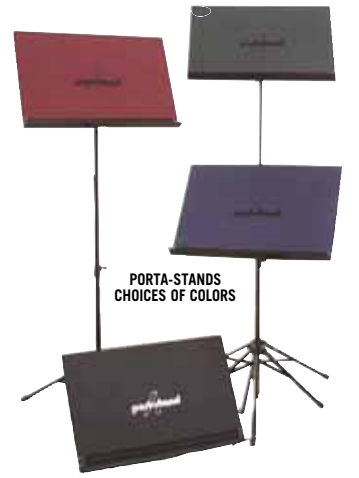
PORTA-STANDS CHOICES OF COLORS