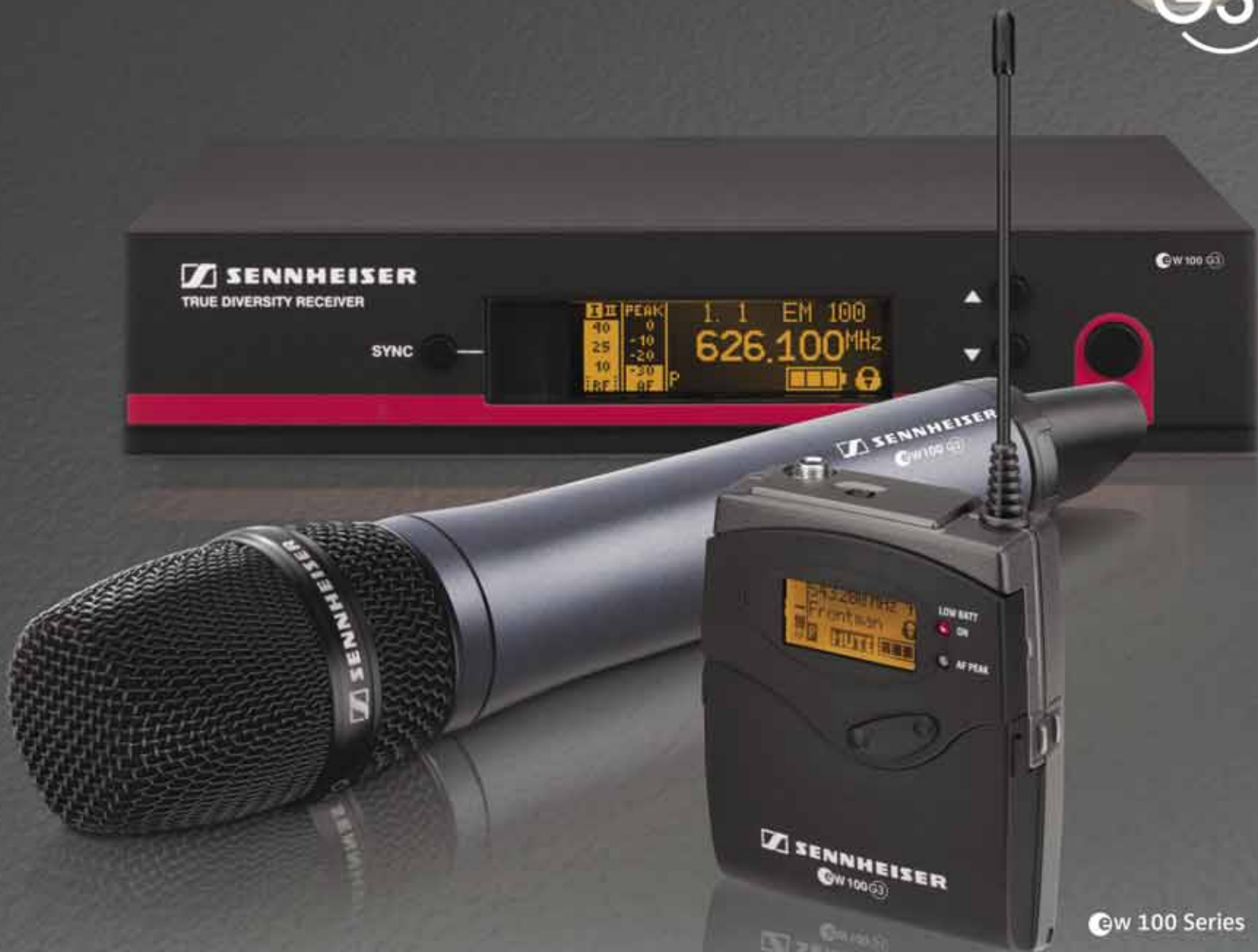
ew 100 Series