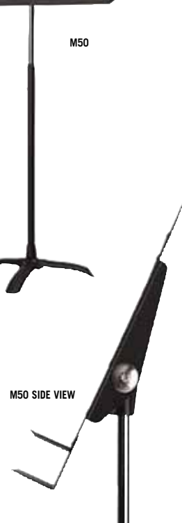
M50 SIDE VIEW