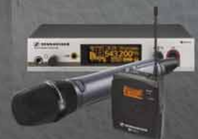
ew 300 Series