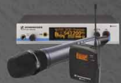
ew 500 Series