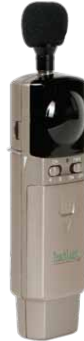
Plug-in Microphone with 3.5mm connector & lanyard