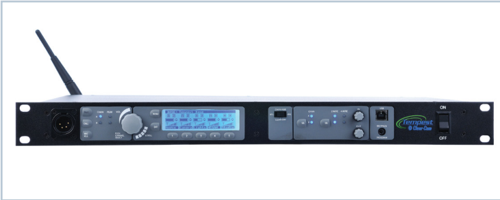
CM-922 2-Channel Tempest Wireless BaseStation