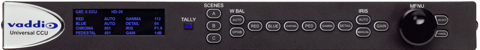
Universal CCU for Vaddio WallVIEW™ HD-20, HD-19 and HD-18 PTZ Camera Systems

CAT-5 Version of the Quick-Connect™ Universal CCU for Vaddio™ PTZ Cameras