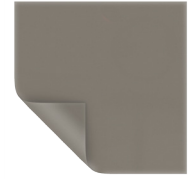
High Contrast Da-Tex