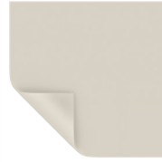
Ultra Wide Angle