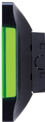
TSS-752-B-S - Side View with optional Multi-Surface Mounting Kit (sold separately)

Crestron Fusion Cloud supports the use of room occupancy sensors to detect when no one has shown up for a scheduled meeting. In such an event, the current reservation can be cancelled automatically to make the room available to others. Occupancy sensors do not connect directly to the TSS-752. They communicate with Crestron Fusion Cloud via a connection to a Crestron control system . Crestron GLS Series Occupancy Sensors [4] are available in a variety of types to support a connection to the control system using Cresnet®, infiNET EX®, or a Versiport I/O port.