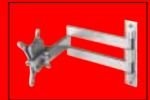
WM-300 Wall Mount Bracket