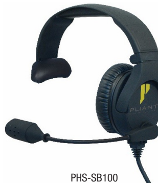
PHS-SB100 Single-Ear Headset