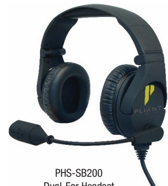
PHS-SB200 Dual-Ear Headset

Pliant Technologies, LLC CrewCom® 205 Technology Parkway Auburn, Alabama 36830 USA www.plianttechnologies.com Phone +1.334.321.1160 Toll-Free 1.844.475.4268 or 1.844.4PLIANT Fax +1.334.321.1162