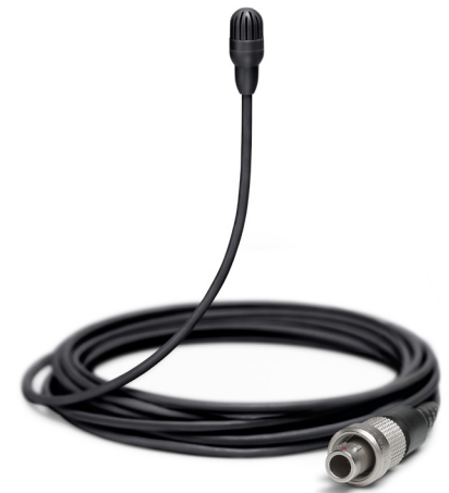
TwinPlex™ TL47 Subminiature Lavalier Microphone