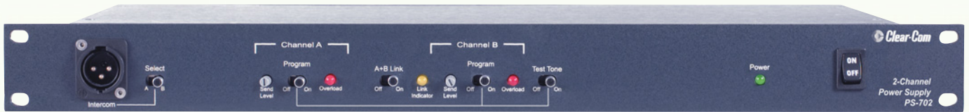
PS-702 Front view

The PS-702 can supply up to 2 amps at 30 volts DC to two channels in a 1-RU. This is sufficient to power up to 40 belt packs, 10 speaker stations, or 12 headset stations even under the most demanding conditions. Either channel is capable of supplying up to 1.2 amps. The full current capacity may be divided between the two channels.