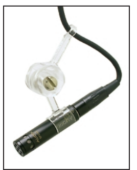
M1245 with invisible cable hanger