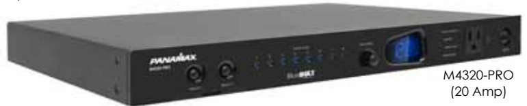
M4320-PRO (20 Amp)

BlueBOLT™ Provides Web Based Remote Power Management to Monitor and Control Your System - From Anywhere, 24/7.