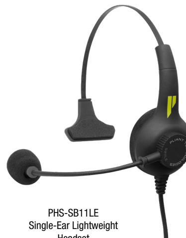
PHS-SB11LE Single-Ear Lightweight Headset