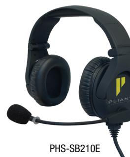
PHS-SB210E Dual-Ear Headset