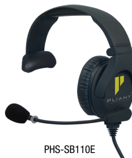
PHS-SB110E Single-Ear Headset