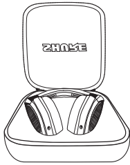
Zippered Hard Travel Case