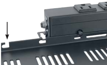
Notches on the shelf's rear flange make it easy to mount a 12" power strip (see options).