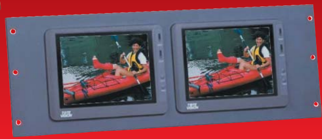
LCD-642D Dual 19" Rack Mount Unit