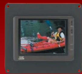
LCD-642 shown with Flush Mount Kit