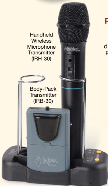
Handheld Wireless Microphone Transmitter (IRH-30)