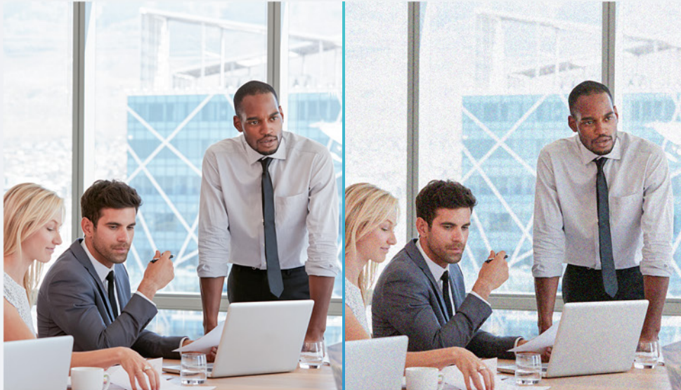
After 2D & 3D DNR