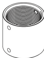
1-1/2" NPS Pipe Coupler