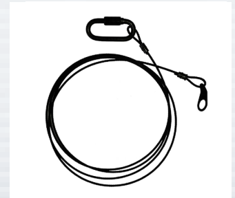
Safety Cable Included