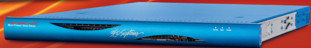
TSS MINI-2100 • 1 Bi-directional, 1 Playout Channel