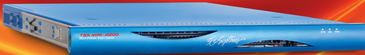
TSS MINI-2200 • 2 Bi-directional Channels