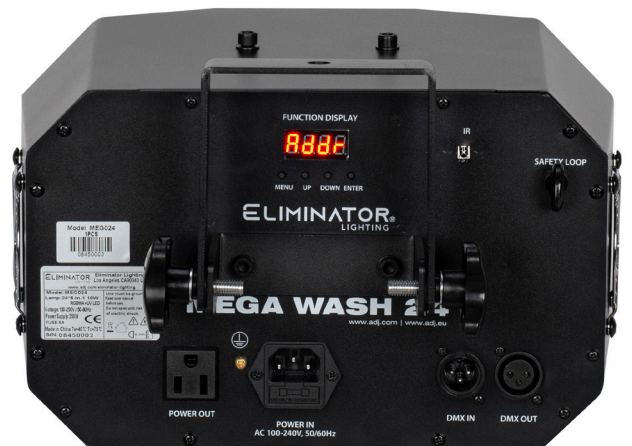
REAR PANEL WITH HANGING BRACKET OPTION 2