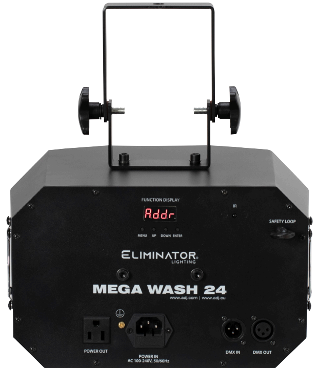
REAR PANEL WITH HANGING BRACKET OPTION 1