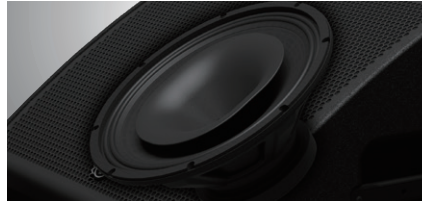
15" coaxial driver

*DHR12M and DHR15M feature a 1.75" coaxial compression driver.