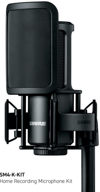
SM4-K-KIT Home Recording Microphone Kit