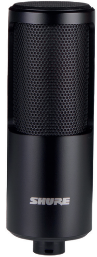
SM4-K Home Recording Microphone