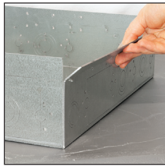
Side breakaway segments allow this box to adapt to walls shallower than 4"D.