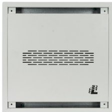
Optional cover panel