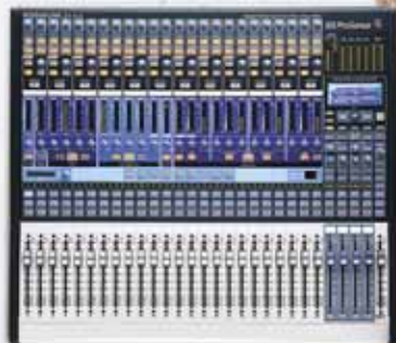
StudioLive 24.4.2 25 XMAX™ preamps 10 monitor mixes with 10 PreFos

Call your Sales Pro at Full Compass today.