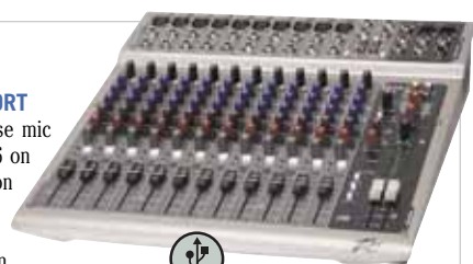
(SELECT MODELS) PV14-USB

All models feature low-noise mic inputs (4 on PV-6 & PV-8, 6 on PV-10, 10 on PV-14 and 16 on PV-20), 3-band EQ (ch 1, 2 on PV-6, all channels on the other models), control room outputs with level control, 2 stereo channels with RCA & 1/4" inputs (no RCA on PV-6), effects send on all channels with stereo return, monitor send on all channels (except the PV-6), and 48V phantom power and contour EQ switches. All mixers also feature inserts on all mono channels (except the PV-6), a "Tape to Control Room" button, which allows you to send a signal from the mixer to 2 separate speaker systems, and a "Tape to Mix" button, which lets you import audio from a secondary source without dedicating an input channel to that source.