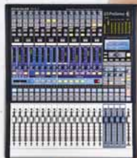
StudioLive 16.4.2 17 XMAX™ preamps 6 monitor mixes with 6 PreFos