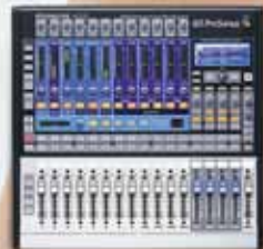
StudioLive 16.0.2 17 XMAX™ preamps 4 monitor mixes with 4 PreFos

P lus full StudioLive™ mixer control with an iPad!