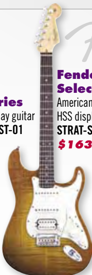
Fender Select Series American Select Stratocaster HSS display electric guitar STRAT-SELECT-RST-01 $1632.99