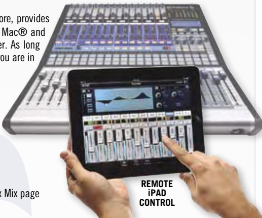
REMOTE IPAD CONTROL