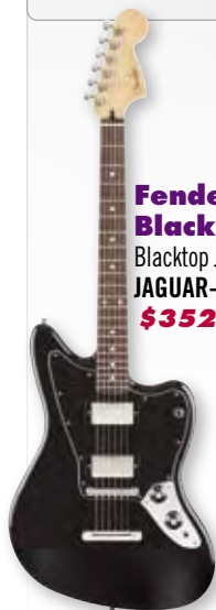
Fender Blacktop Series Blacktop Jaguar display guitar JAGUAR-BLACKT-RST-01 $352.80