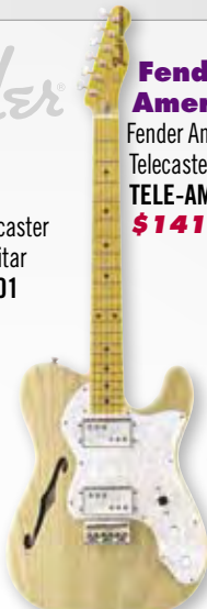
Fender American Series Fender American Vintage '72 Telecaster Thinline display guitar TELE-AMVIN-72-RST-01 $1411.20